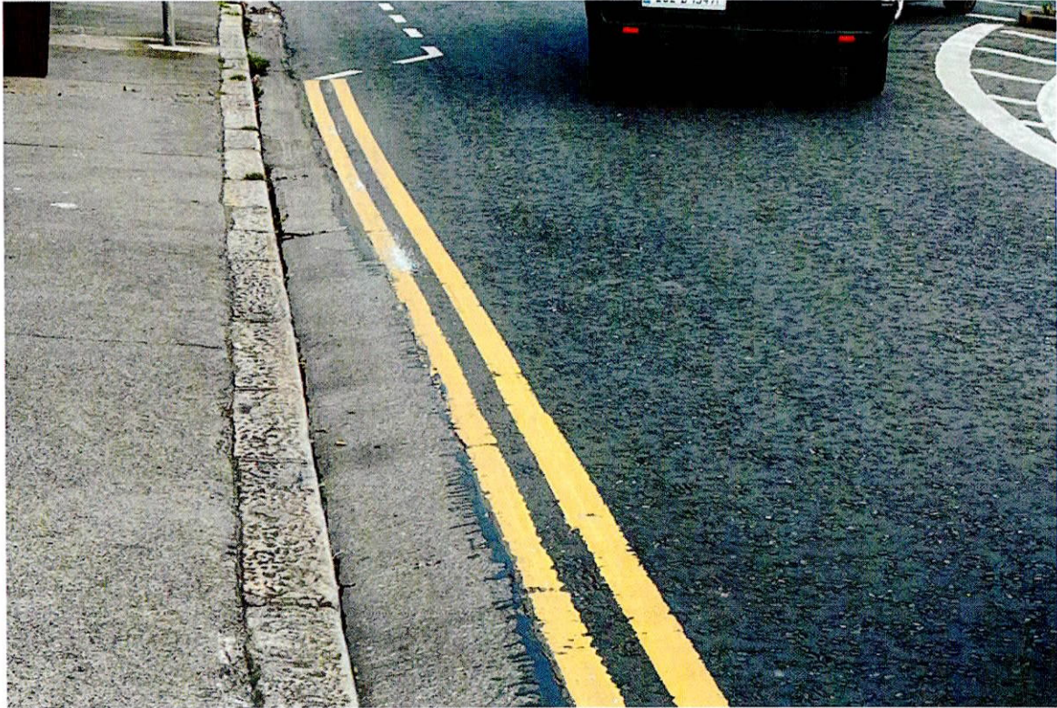
Existing granite kerbing on Sarsfield Road outside Woodfield Terrace that will be moved

Outside my house on Sarsfield Road there are existing granite kerbs. The 'Landscape General Arrangement' drawing sheet 19 shows that there will be new kerbs and new footpaths between number 5 Woodfield Terrace (my direct neighbour) to 106 Inchicore Road.