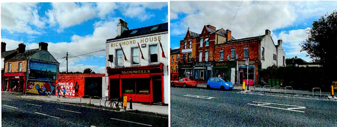
Cycle parking on Emmet Road, Inchicore that will be removed without any replacement

EIAR Chapter 6 page 35 notes that there will be no cycle parking provided along a 700m stretch of Emmet Road from Spa Road to Inchicore Library. This includes removing existing cycle parking from outside the shops at 118-122 Emmet Road and from outside McDowell's pub/Richmond Park Stadium.